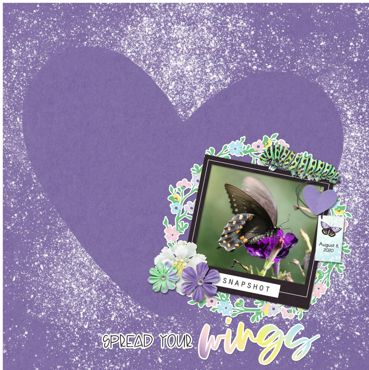
Photo and Page: Carla Shute Kit: Metamorphose by KimB Designs Font: Arcon

This is how I finished my page. I love the contrast between the white splatter and dark background paper and the defined stenciled edge of the heart embellishment shape.